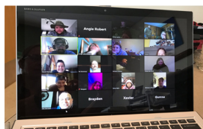
Zoom lunch with High School Staff.